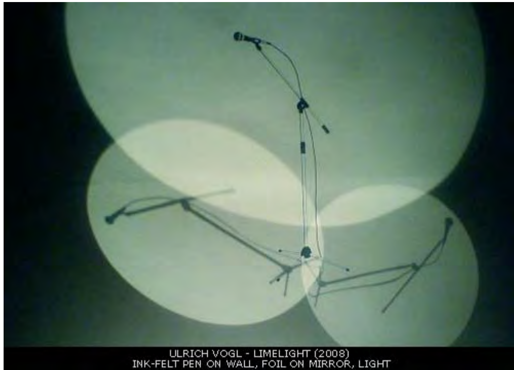
ULRICH VOGL - LIMELIGHT (2008) INK-FELT PEN ON WALL, FOIL ON MIRROR, LIGHT

Silvia Scaravaggi: Slide projectors often appear in your recent works [( O.T. , Strich (2010), Fenster-Berlin (2010), Kubus-Dia (2010)], do they mean something special? Are they always different to each other, is this important as well?